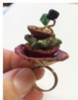
Stack Rings Jane Cook