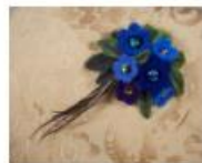
Felted Flowers Pat Pawlowicz