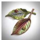
Ladybug on a Leaf