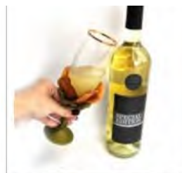
POLYMER CLAY FLOWERS TUTORIAL – GOBLET FLOWER "FLOWER ACADEMY" (EBOOK+VIDEO) $22.00