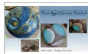
Faux Aged Ceramic ... $23 Sophy Dumoulin In this CraftArtEdu class, Sophy Dumoulin will teach you how to make a hollow lentil with ...