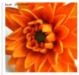
POLYMER CLAY FLOWERS TUTORIAL – DAHLIA FLOWER "FLOWER ACADEMY" (EBOOK+VIDEOS) $24.00