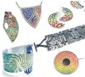
Creating with Aluminum: Cutting, Etching & Colouring with Maggie Bergman