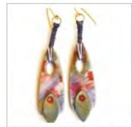
INKREDIBLE MACRAME "IMPRESSIONISM IN PURPLE" POLYMER CLAY TUTORIAL, ALCOHOL INKS & MICRO MACRAME (EBOOK+VIDEOS) $27.00