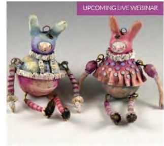
Making Jiggly Jointed Dolls from Polymer Clay