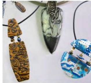
Creative Clay Combinations with Debbie Carlton