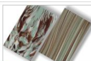
Striped and Sym ... Paola Mattioli Learn to create two great effects with scrap clay! In this free class, you'll learn to cre ...