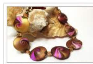
Original Price: $25.00 Special Rate: $18.00 Gradient Swirly L ... Sandy Huntress Learn to create beautiful gradient