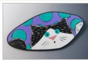
Original Price: $30.00 Special Rate: $22.50 The Cat's Meow ... Donna Kato Learn how to make a carved cat