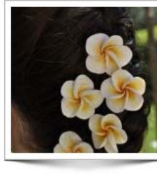
POLYMER CLAY FLOWERS TUTORIAL – FRANGIPANI/PLUMERIA FLOWER "FLOWER ACADEMY" (EBOOK+VIDEO) $17.00