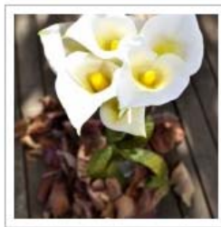
POLYMER CLAY FLOWERS TUTORIAL – CALLA LILY FLOWER "FLOWER ACADEMY" (EBOOK+VIDEO) $22.00