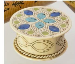
Learn to Make Polymer Clay Faux Ivory, Jade, Lapis, Turquoise and More with Mags Bonham MAGS BONHAM $44.95