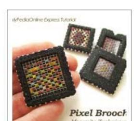
POLYMER CLAY TUTORIAL – MOSQUITO TECHNIQUE HIGH-TECH PIXEL FRAME BROOCH (EBOOK+VIDEO) $18.00