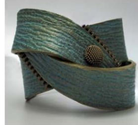
Learn to make Polymer clay wrap bracelets with Helen Breil HELEN BREIL $44.95