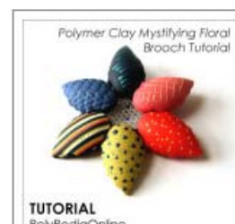
POLYMER CLAY TUTORIAL – MOSQUITO TECHNIQUE MYSTIFYING FLORAL BROOCH (EBOOK) $18.00