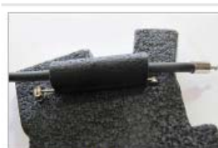
Pin to Pendant Co ... Free! Bettina Welker Bettina shows you how to convert that lovely pin/brooch into a pendant with a very clever ...