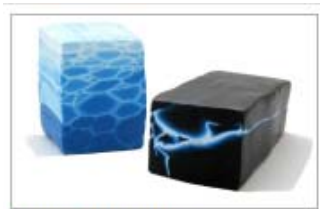
Water and Lightn ... $18 Claire Wallis You'll learn how to create two canes in this class – both with wonderful visual effects.