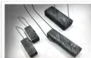
Draw Me a Sheep w ...