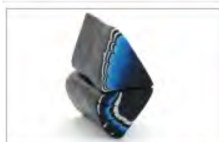
Butterfly Wing C ...

Claire Wallis Learn how to make this beautiful butterfly wing cane