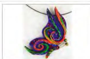
Butterfly Pendant ...

Ann Kruglak Learn to make this graceful butterfly that can be transformed into a pin or a pendant!