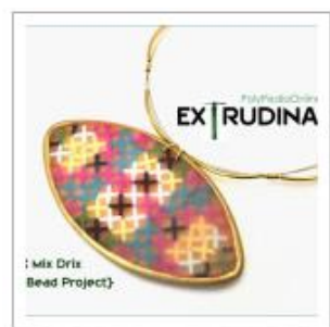
EXTRUDINARY POLYMER CLAY X MIX DRIX PENDANT & TILE BRACELETS (EBOOK+VIDEO) $22.00