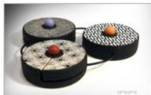
Box Clasp wit ... Nikolina Otrzan Whether you need a clasp for your necklace or you just like them as a great design solutio ... $30