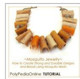
~Mosquito Jewelry~ How to Create Strong and Durable Designs and Beads using Mosquito Mesh PolyPediaOnline TUTORIAL POLYMER CLAY BEADS & NECKLACE TUTORIAL – MOSQUITO TECHNIQUE (EBOOK) $21.00