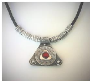
Curio Starter Class Using EZ960 Silver Metal Clay CINDY POPE $44.95