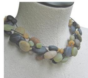
Making Beach Pebbles from Polymer Clay with Cynthia Tinapple CYNTHIA TINAPPLE $24.95