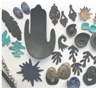
Polymer Clay Cut Ups: Putting your Silhouette Curio™ to work CYNTHIA TINAPPLE $44.95