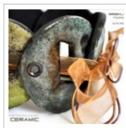
POLYMER CLAY TUTORIAL FAUX CERAMIC – GREENLAND BRACELET “COSMIC CERAMIC” (EBOOK+VIDEO) $24.00