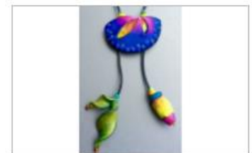
Alien Flower with ... Cecilia Botton $20 Achieve rich, dramatic color as you make a fun eye-catching necklace!