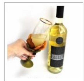
POLYMER CLAY FLOWERS TUTORIAL – GOBLET FLOWER “FLOWER ACADEMY” (EBOOK+VIDEO) $22.00