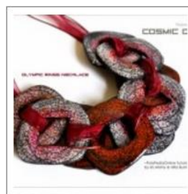
POLYMER CLAY TUTORIAL FAUX CERAMIC – OLYMPIC RINGS NECKLACE “COSMIC CERAMIC” (EBOOK+VIDEO) $24.00