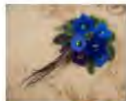
Felted Flowers Pat Pawlowicz