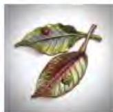
Ladybug on a Leaf