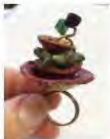
Stack Rings Jane Cook