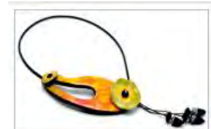
Original Price: $35.00 Special Rate: $24.50 Unbalanced Neckla ... Olga Nicolas Learn how to make a colorful,