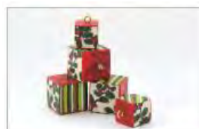
Original Price: $23.00 Special Rate: $17.00 Holiday Candles a ... Claire Wallis Follow along as Claire shows you