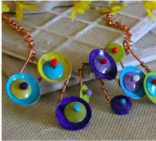
Polka Dot Enameling with Debora Mauser DEBORA MAUSER $44.95