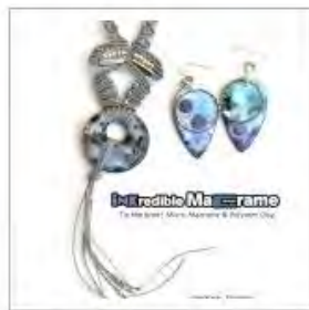
INKREDIBLE MACRAME "ALIENS FASHION NECKLACE" POLYMER CLAY, ALCOHOL INKS & MICRO MACRAME TUTORIAL (EBOOK+VIDEOS) $27.00