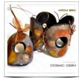
POLYMER CLAY TUTORIAL FAUX CERAMIC – APONI BEADS BRACELET "COSMIC CERAMIC" (EBOOK+VIDEO) $24.00