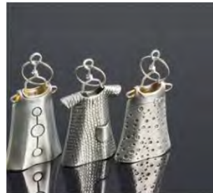
Metal Clay Dress Pendant and Shadow Box Vignette with Sue McNenly SUE MCNENLY $39.95