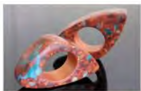
Original Price: $48.00 Special Rate: $13.00 Faux Boulder Op ... Claire Wallis Learn to create a gorgeous ring