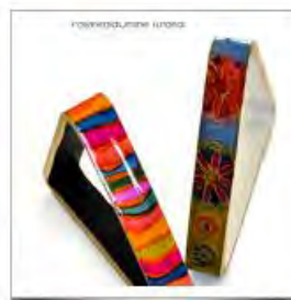
ALCOHOL INKS POLYMER CLAY TUTORIAL – INKREDIBLE FABRIC FANTASTIC BRACELETS (EBOOK+VIDEO) $22.00