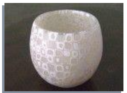
Saturday, December 2, 2017 Translucent & Opaque Extrusions for Polymer Clay Votives ~ 9am - 2 pm

Here is a project that is perfect for the holidays. Learn to use an extruder to make translucent and solid color canes. Then use the canes to cover small votive glasses. The translucent clay will allow light from a candle to shine through and augment the design. Use these at home or give them away as gifts. Materials: Participants will need a clay extruder, (or borrow from instructor), translucent, white and/or colored clay, blades, small circle shape cutters, and other