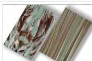
Striped and Sym ... Paola Mattioli Learn to create two great effects with scrap clay! In this free class, you'll learn to cre ...