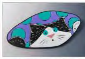
Original Price: $30.00 Special Rate: $22.50 The Cat's Meow ... Donna Kato Learn how to make a carved cat