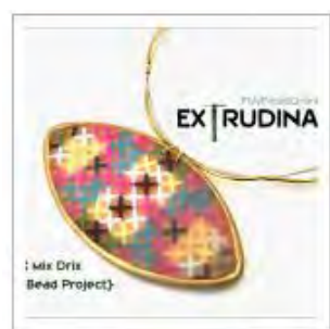
EXTRUDINARY POLYMER CLAY X MIX DRIX PENDANT & TILE BRACELETS (EBOOK+VIDEO) $22.00