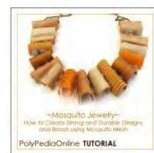
POLYMER CLAY BEADS & NECKLACE TUTORIAL – MOSQUITO TECHNIQUE (EBOOK) $21.00