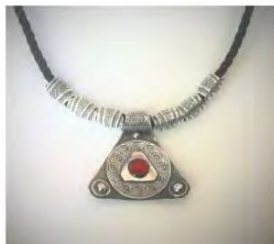
Curio Starter Class Using EZ960 Silver Metal Clay CINDY POPE $44.95