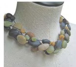
Making Beach Pebbles from Polymer Clay with Cynthia Tinapple CYNTHIA TINAPPLE $24.95