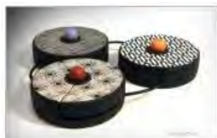
Box Clasp wit ... Nikolina Otrzan Whether you need a clasp for your necklace or you just like them as a great design solutio ... $30