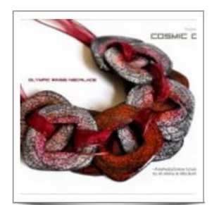
POLYMER CLAY TUTORIAL FAUX CERAMIC – OLYMPIC RINGS NECKLACE "COSMIC CERAMIC" (EBOOK+VIDEO) $24.00