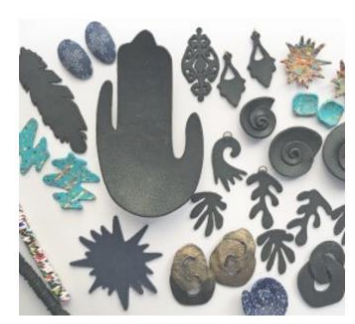
Polymer Clay Cut Ups: Putting your Silhouette Curio™ to work CYNTHIA TINAPPLE $44.95