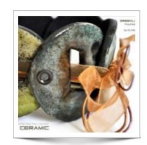
POLYMER CLAY TUTORIAL FAUX CERAMIC – GREENLAND BRACELET "COSMIC CERAMIC" (EBOOK+VIDEO) $24.00