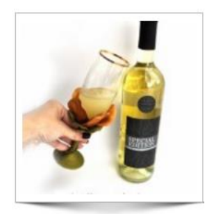
POLYMER CLAY FLOWERS TUTORIAL – GOBLET FLOWER "FLOWER ACADEMY" (EBOOK+VIDEO) $22.00