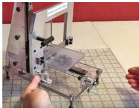
4"x4"x4" work area and weighs 5.6lbs

The PRO Slicer's first run was sold out, but it will be available again in July.