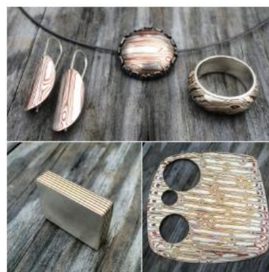
One Metal from Many: Contemporary Mokume-Gane