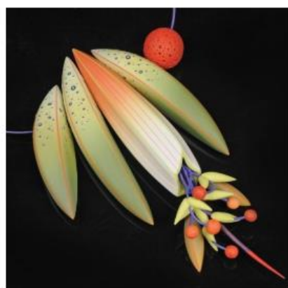
Polymer Jewelry Duet: Two Techniques

“Have you experienced creative flow? Snow Farm is committed to offering 5-day workshops where creative immersion with energized focus and full involvement is possible. At these longer workshops you get 26.5 hours of instruction and over 30 hours of open studio time! Imagine what you will accomplish in the flow . . . Sign up now for full week workshop in August through October.”