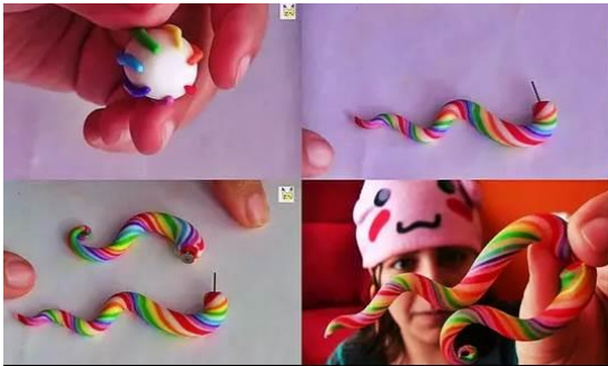
Video Tutorial: Rainbow Swirl “Fake Stretch” Earrings:

https://www.youtube.com/watch?v=jelt7afbjw8