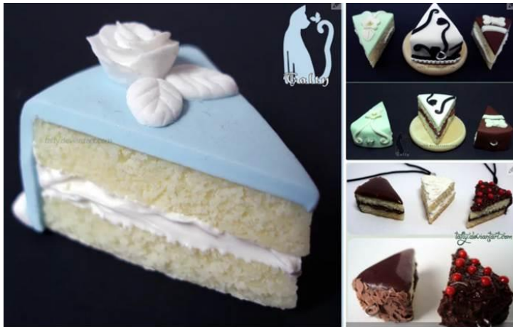
Realistic Polymer Clay Cake:

https://www.instructables.com/Polymer-Clay-Cake-Tutorial/