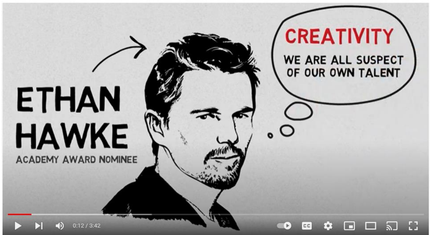
Why Art is NOT a Luxury | by Ethan Hawke

Click on the link to watch: Why Art is NOT a Luxury | by Ethan Hawke