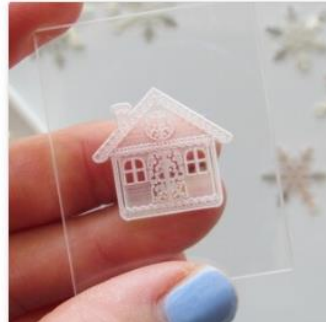
Mini Acrylic Embossing Stamp - 1.9" x 1.57" outer frame dimensions (=50mm x 40mm) Gingerbread House $3.60