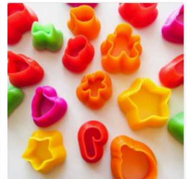
Christmas Mini Cutters Set