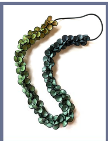
PETAL MALA MUTED GREENS ($95 US APPROX.)