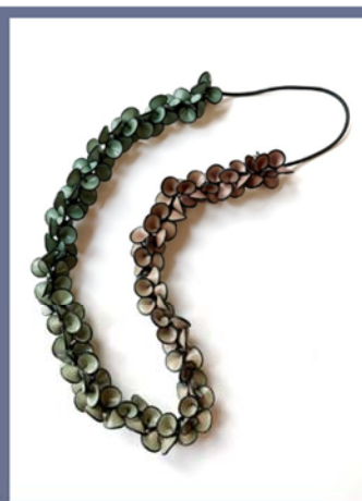
PETAL MALA MUTED GRAY/GREEN ($95 US