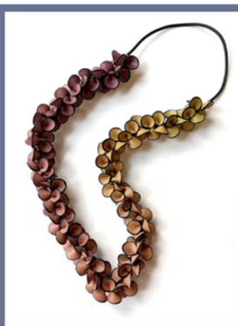
PETAL MALA MUTED PINKS/YELLOWS ($95 US