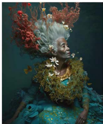
22 Mermaids - 013