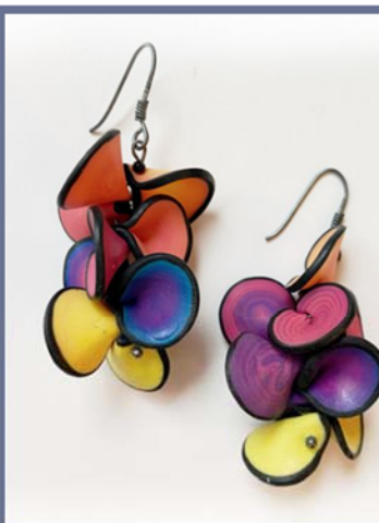
PETAL EARRINGS ($45 US APPROX)