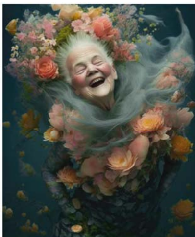
22 Mermaids - 010