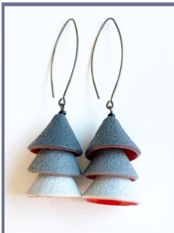
TRIPLE BELL EARRINGS IN GRAYS ($45 US APPROX)