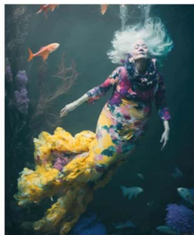
22 Mermaids - 005