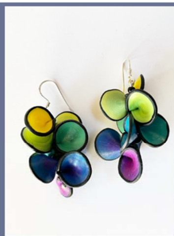
PETAL EARRINGS - COOL ($45 US APPROX)