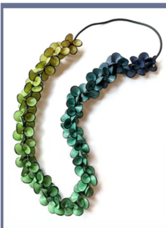
PETAL MALA COOL ($95 US APPROX.)