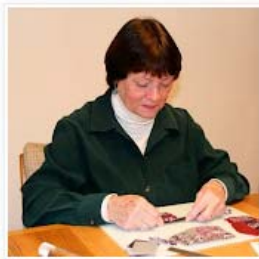
Playing with clay