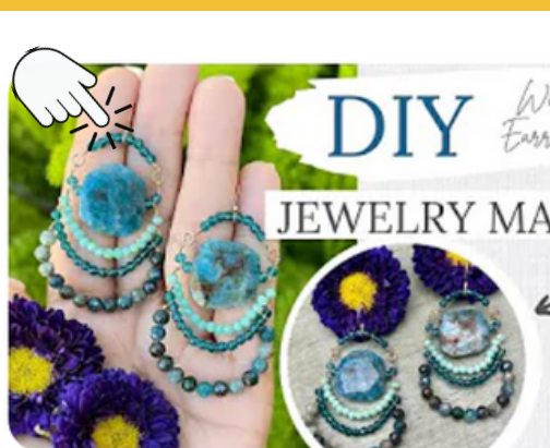
Handmade Wire Wrapped Statement Earrings Jewelry Making