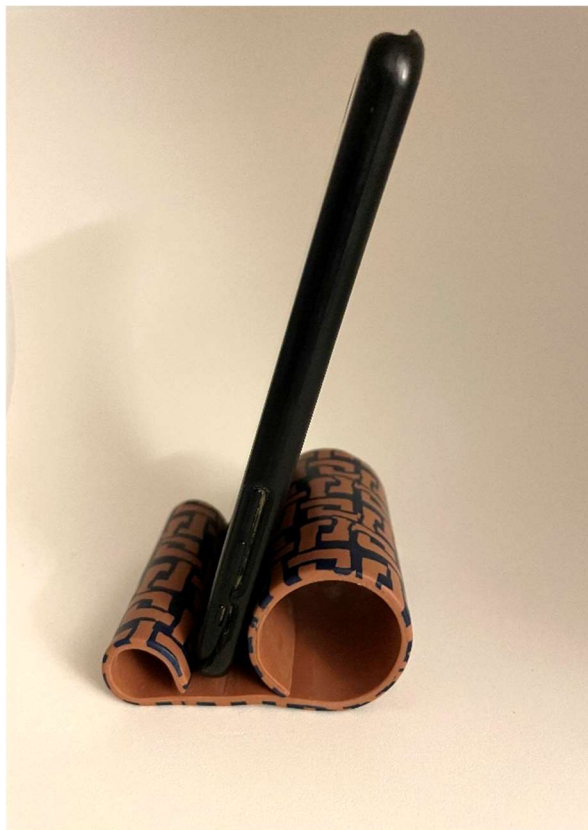
Figure 2: Angle of cell phone in holder