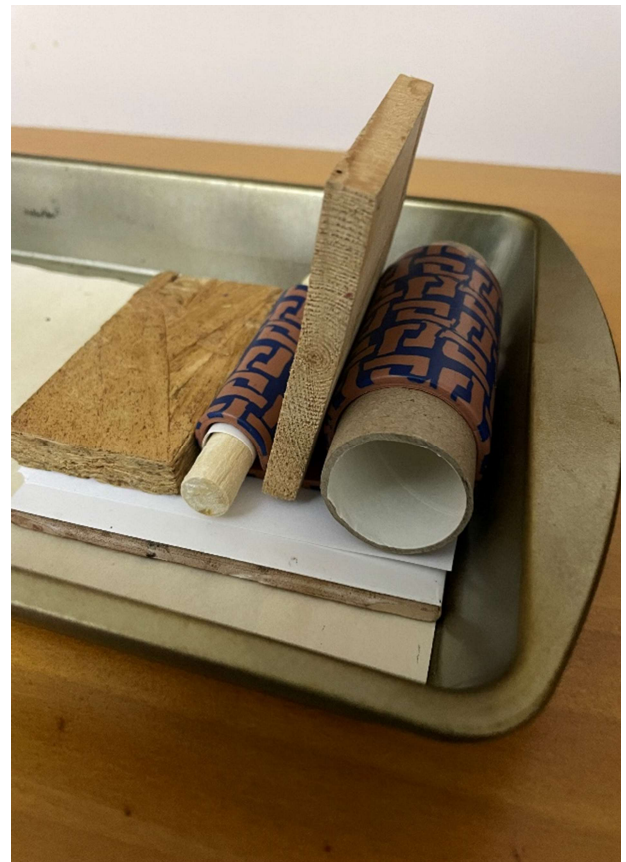
Figure 3: Arrangement for curing in baking pan